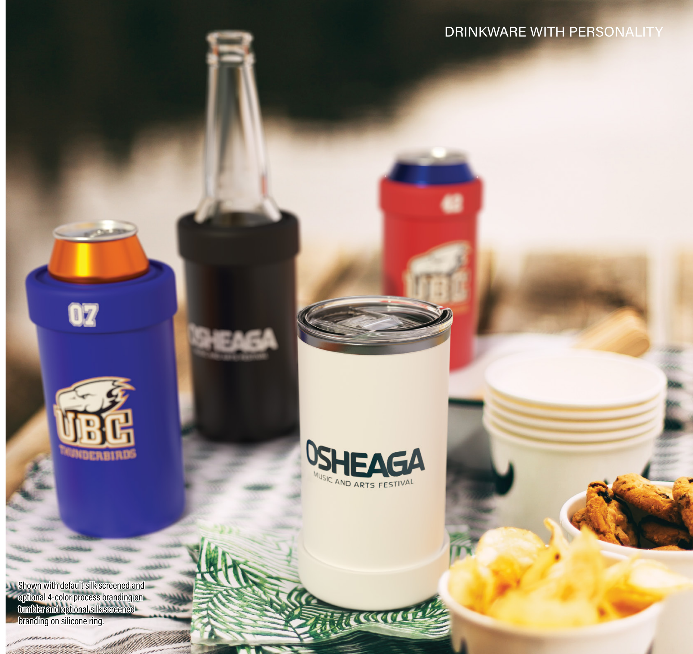
Shown with default silk screened and optional 4-color process branding on tumbler and optional silk screened branding on silicone ring.